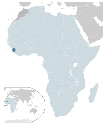
Location of Sierra Leone

For the slaves of Loyalists who left with the English, however, freedom remained only a dream. Most remained the property of their Loyalist owners, and when their owners relocated to Jamaica or eastern Florida, their slaves once again returned to the fields.