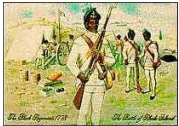
1 st Rhode Island Regiment

In fact, the regiment was so impressive in its fighting ability that it was hand-picked to attack the British defensive strongholds that led to the victory at Yorktown. Unfortunately, by the end of the war only one-third of these former slaves who had enlisted survived to enjoy their freedom as civilians.